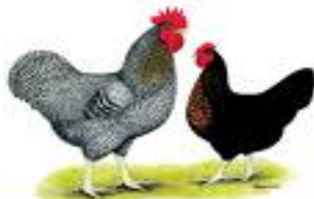
Black Sex Link