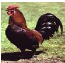
Rhode Island Red